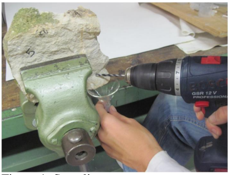
Figure 1: Sampling

Since the inhomogeneity of the limestone was taken into account, about 200 mg of stone powder were gained by drilling at three different areas. From these 200 mg an aliquot of 30 - 50 mg was taken for short time irradiation (one minute) in the pneumatic transport system. 130-150 mg was reserved for long term irradiation (one hour). To prevent contamination of the sample during drilling, a high purity wolfram electrode, which had been sharpened, was used (figure 1).